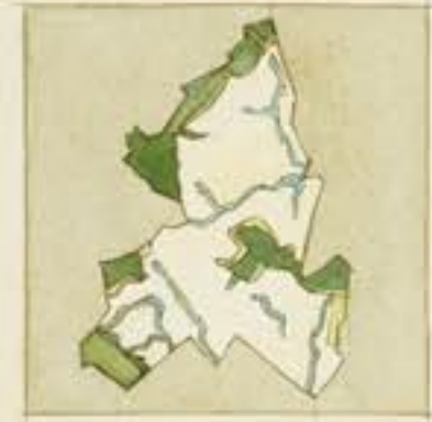
Forest, Wildlife and Water