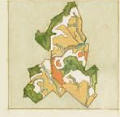
Combined Preservation Zones