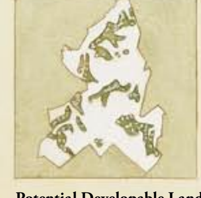
Potential Developable Land